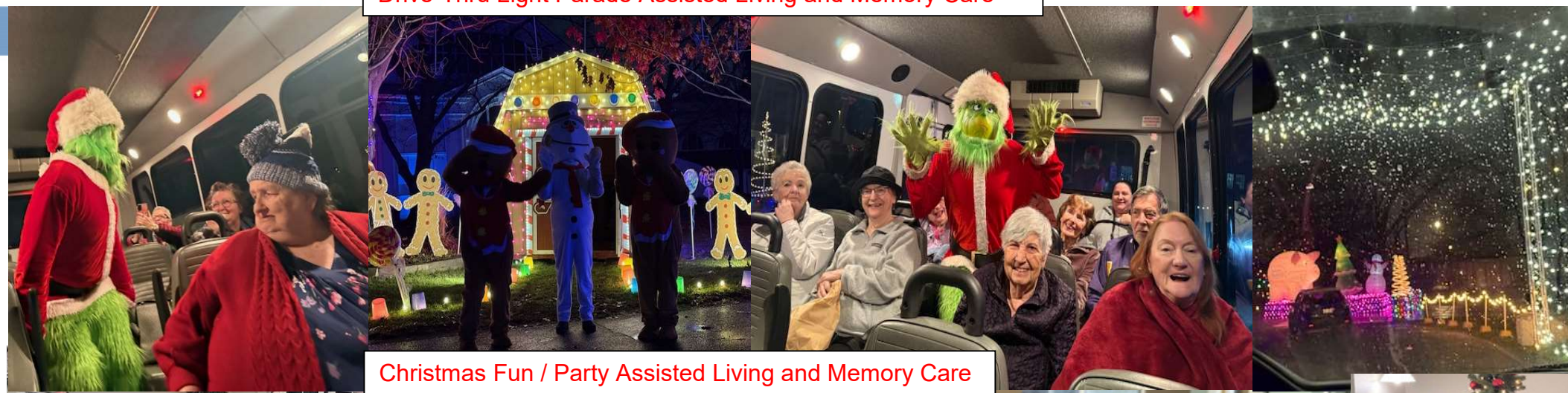
Christmas Fun / Party Assisted Living and Memory Care

Bus Outing Bus Outing Binder Will be at the Informational table. Please take a look and sign-up to any outings you may be interested in to secure your spot!