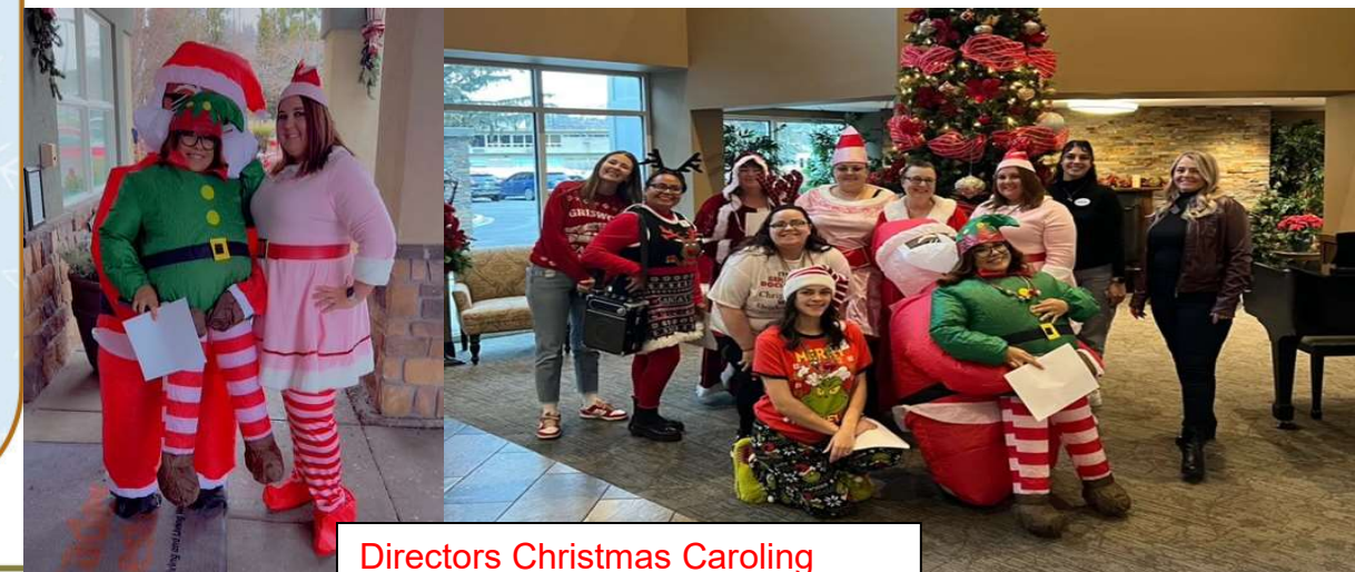
Directors Christmas Caroling