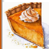
Enjoying Family Pie Day!!