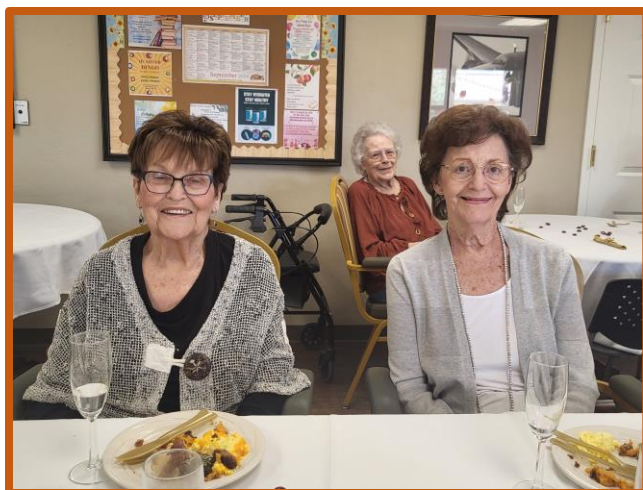
Sometimes, All You Need is Good Company!!