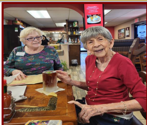
We Always Enjoy Discovering New Restaurants!