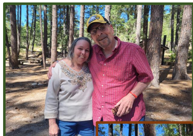
Another Beautiful Picnic for The Lodge in Mt. Lemmon