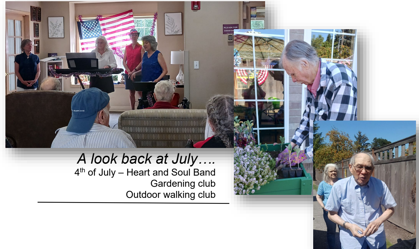
A look back at July.... 4 th of July – Heart and Soul Band Gardening club Outdoor walking club

Tony Bennett – August 3, 1926 Neil Armstrong – August 5, 1930 Julia Child – August 15, 1912 Robert Redford – August 18, 1936